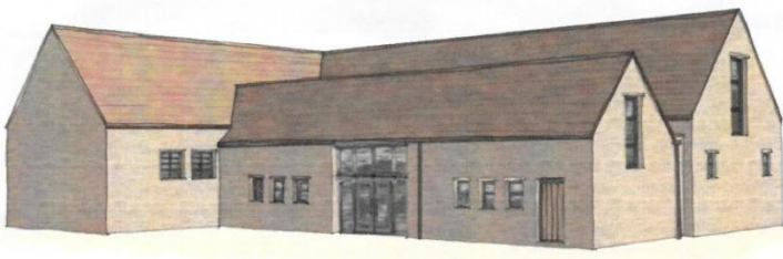
St Joseph's Catholic Church Arkell Avenue, Carterton, OXON OX18 3BS