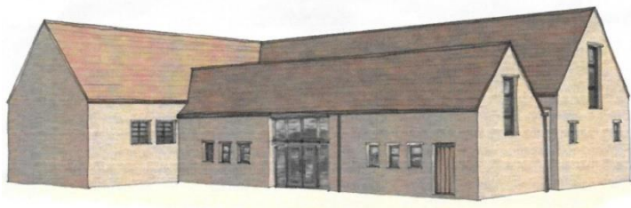
St Joseph's Catholic Church Arkell Avenue, Carterton, OXON OX18 3BS